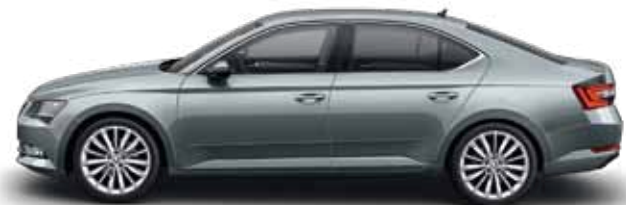
Business Grey Metallic