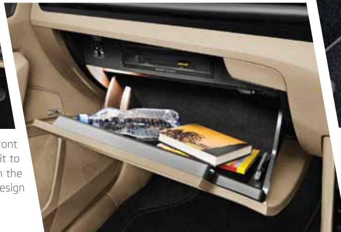
The storage compartment in the dashboard on the front passenger side can also be cooled, when the air conditioning is on.