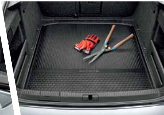
Double Sided Boot Mat (Textile/Plastic)