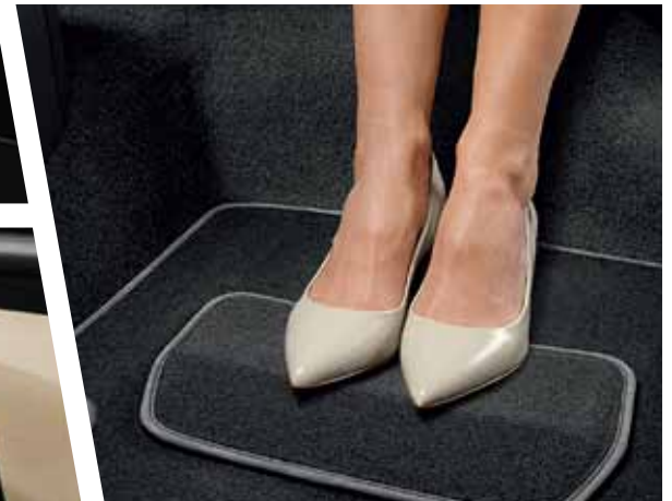
This angled foot rest at the rear attached to the textile floor mats makes long trips even more comfortable.