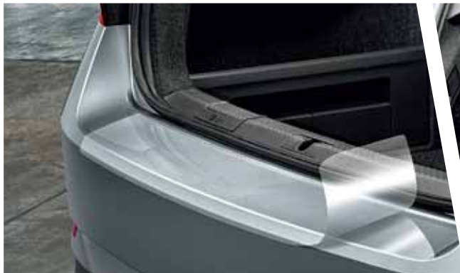
Rear Bumper Protective Foil