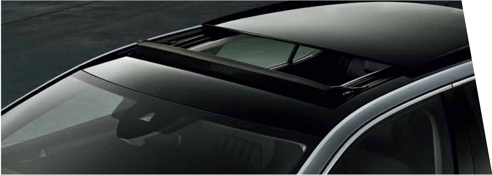
The Superb will open up new vistas with the electronically-adjustable panoramic sunroof, which will expand the feeling of space.