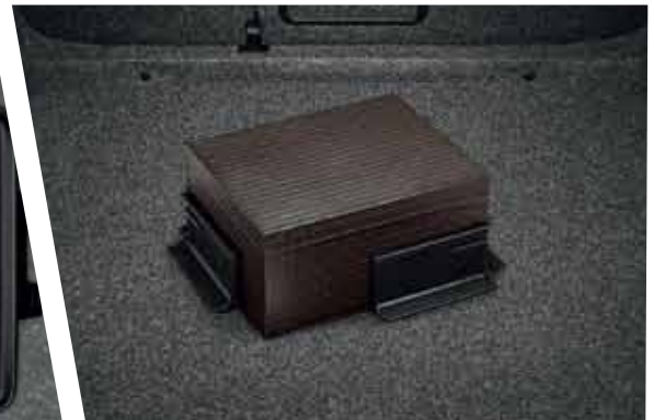
Universal Fixing Element