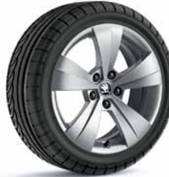
17" HELIOS ALLOY WHEELS - STYLE