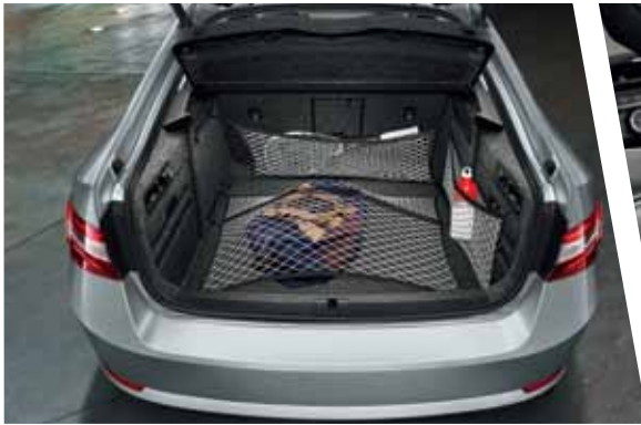
Rear Boot Netting System