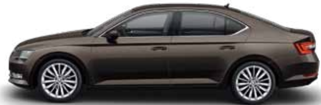
Magnetic Brown Metallic