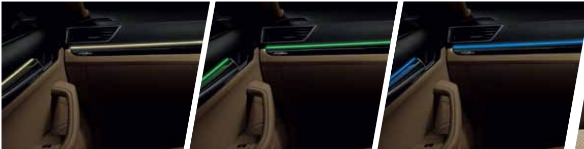
Warm white ambient lighting

Make your space more cosy and comfortable with soft, harmonious ambient lights that run along the inside of the car, setting the perfect mood for any journey.