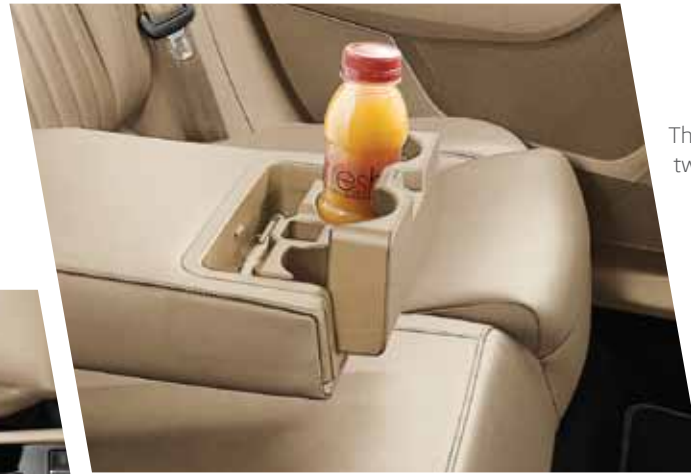
The rear seat centre armrest is integrated with twin cup holders and storage

There's a place for everything, even in your car. The new Superb features a multitude of compartments, pockets and holders, keeping your elegant interior tidy, and your belongings safe from loss, breakage or spillage.