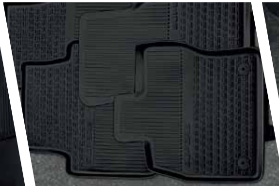
Rubber Mat (Front & Rear)