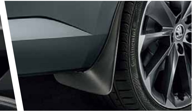
Front Mud Flaps