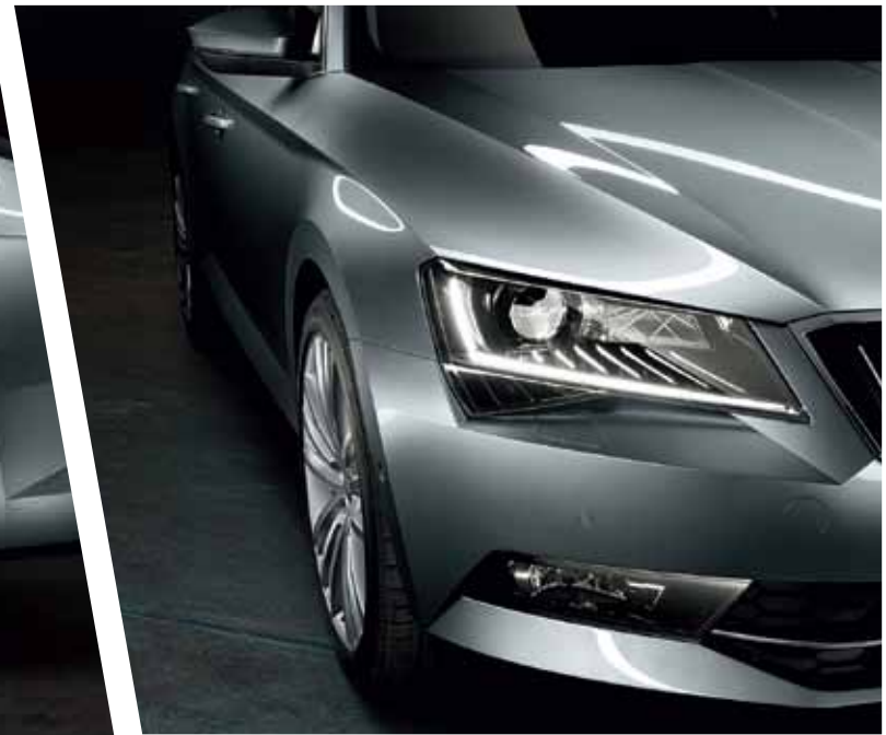
The imposing lines of the bonnet are complemented by the profiled contours of the headlamps and the equally crisp front fog lamps - their design paying homage to Czech glass-making.