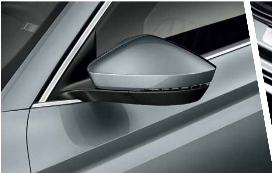
The sleek sharp contours of the external side-view mirrors with integrated indicators whip up a sporty look, while the large mirror ensures total functionality.