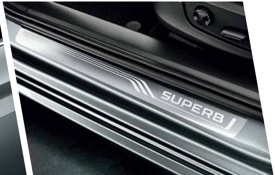
The style quotient of the car is underlined by the decorative door-sill strips with the Superb inscription. A clear nod to the car's overall blend of form and function.