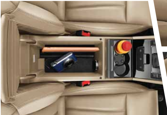
The spacious Jumbo Box storage compartment is housed in the front armrest. You can store your electronic items safely inside or cool it to keep your snacks fresh. A dual drinks holder can also be found on the centre console. The "Easy Open" bottle holder has an anti-slip design which allows the driver to open the bottle with just one hand.