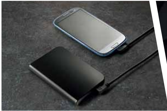
USB Connection Cable - Apple/Mini/Micro USB

Your new Superb will share and support your lifestyle. Thanks to thoughtful ŠKODA Genuine Accessories you can customise your car according to your needs and deeds.