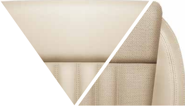
STONE BEIGE LEATHER - STYLE