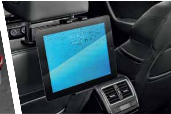
Smart Holder- Multimedia Holder (Head Rest With Adaptor & Arm Rest)