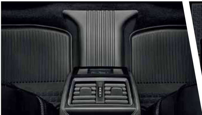
Rubber Mat Over Tunnel